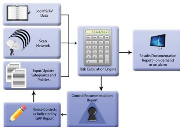
Fig. 2 - HIPAA Compliance Methodology

The overall ACR2 automated risk management process is shown in fig. 2. IPS and Anti-Virus data, network scan data, and policy data are input into the Risk Calculation Engine. This creates the Results Documentation Report and the Control Recommendations Report. The changes in controls are implemented and the changes are added to the risk engine, along with updated Scan and IPS/AV data. This cycle can be repeated as often as daily, with reports on demand, on schedule or on alarm.